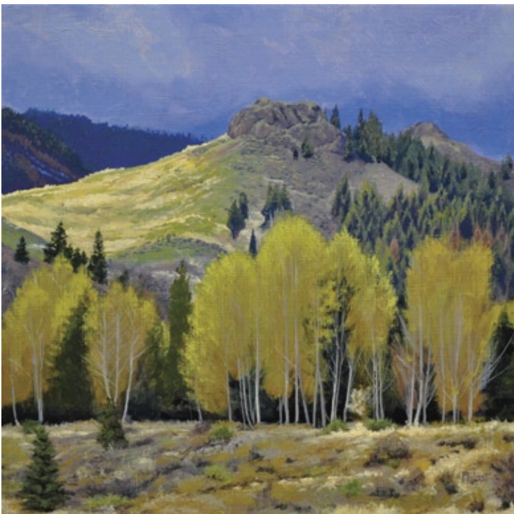
NEAL PHILPOTT, OUT CROP, OIL ON PANEL, 10 X 10"