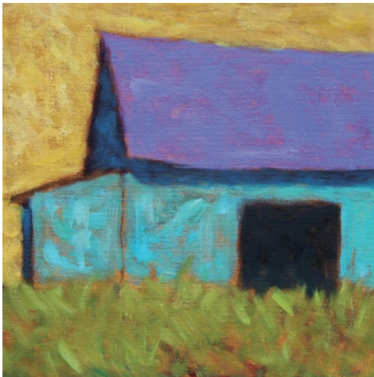
PETER BATCHELDER, BLUE BARN, OIL ON CANVAS, 12 X 12"

For a direct link to the exhibiting gallery go to